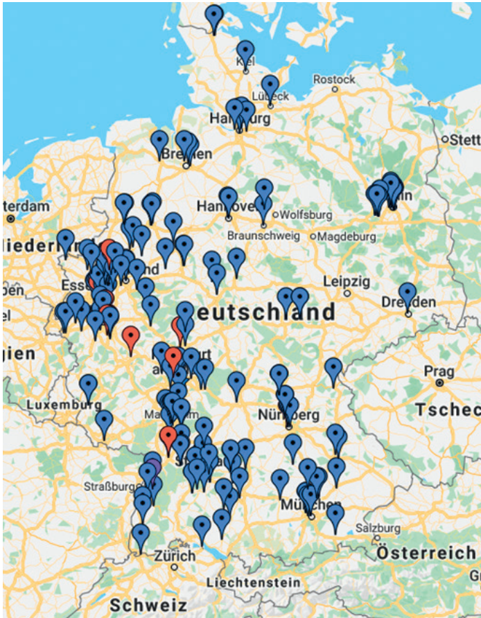
FIGURE 1 KCID-Map of the Christian-Muslim Dialogue in Germany SOURCE: https://www.google.com/maps/d/viewer?hl=de&mid=1rNei8tiwF9jFLklMiTOHieH8uAs&ll=51.16600352771898%2C18.634309840217156&z=6

Inter alia, the Koordinierungsrat is in charge of the project ' Aktives Dialogmanagement in Deutschland (PRODIA) ' that has published an interactive map of Christian-Muslim dialogue initiatives in Germany. The entries to this map can be visualized via 'google maps':