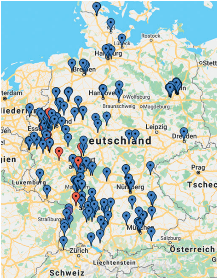
FIGURE 1 KCID-Map of the Christian-Muslim Dialogue in Germany

Inter alia, the Koordinierungsrat is in charge of the project ' Aktives Dialogmanagement in Deutschland (PRODIA) ' that has published an interactive map of Christian-Muslim dialogue initiatives in Germany. The entries to this map can be visualized via 'google maps':